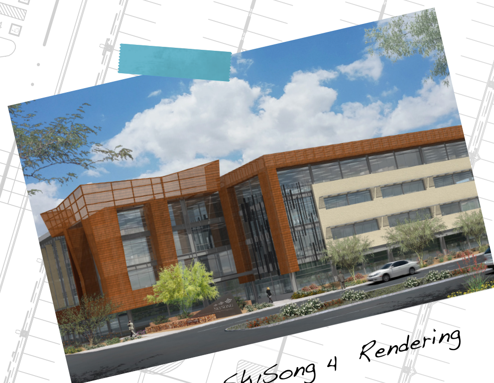
SkySong 4 Rendering