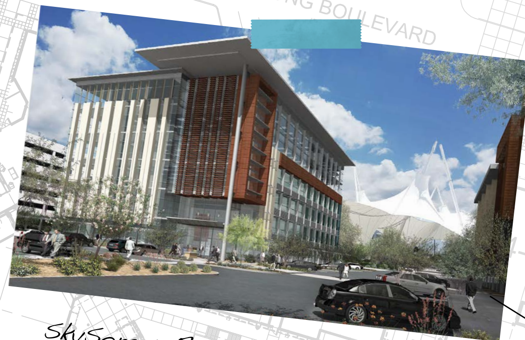
SkySong 6 Rendering