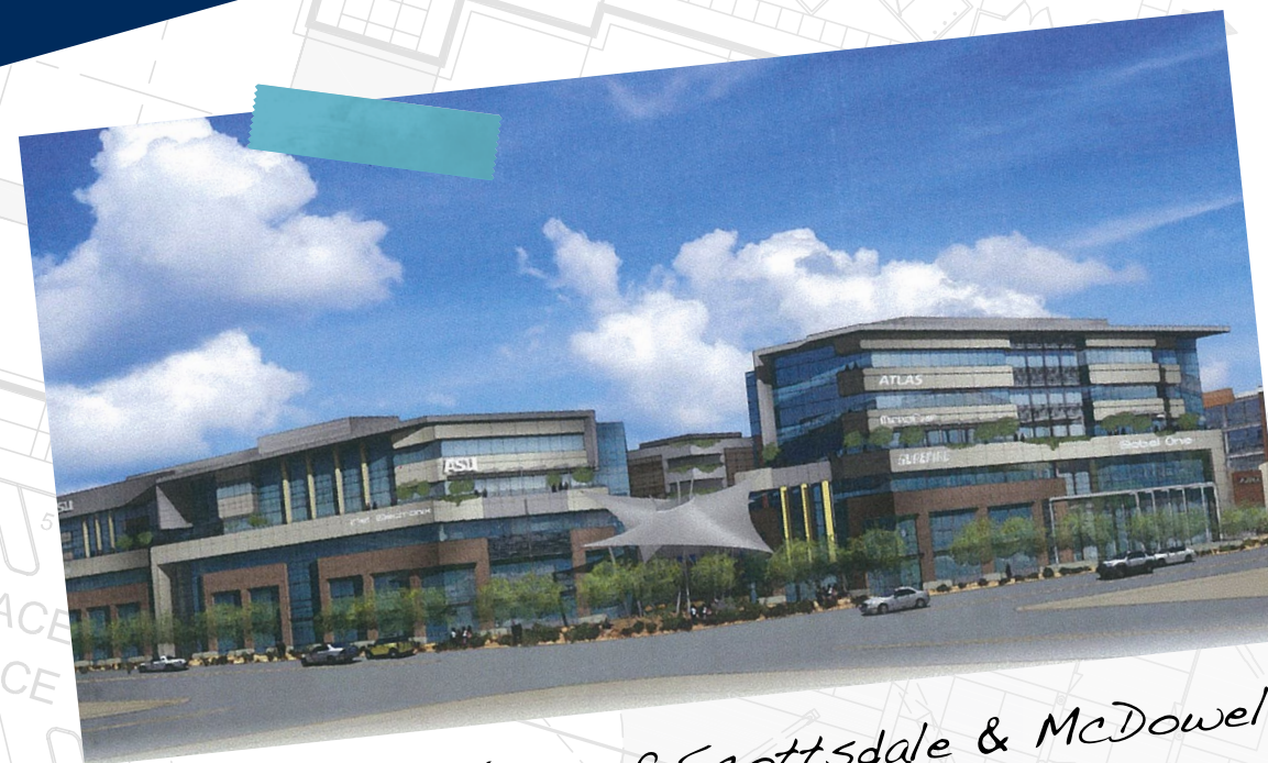
Future View of Scottsdale & McDowell