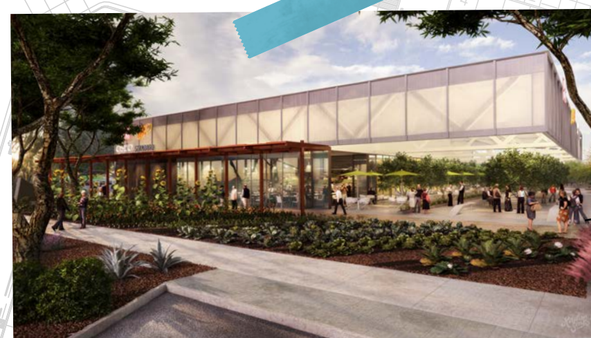
SkySong Retail Space