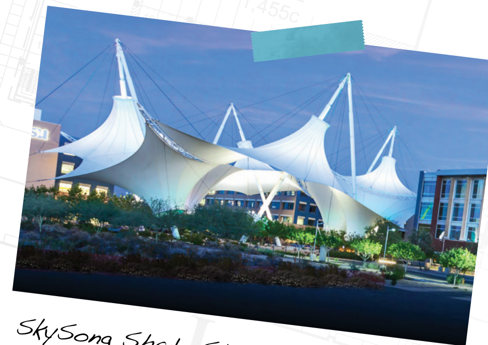
SkySong Shade Structure